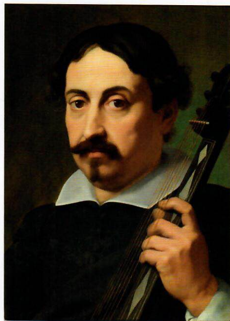
3. Portrait of a Musician, c. 1628–30, Daniele Crespi (1597/98–1630), oil on panel, 48 × 35cm.