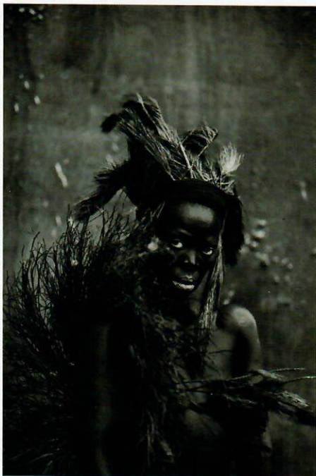
2. Isiqhaza I , Philadelphia, 2018, Zanele Muholi (b. 1972), silver gelatin print, 90.2 × 60cm. Stevenson at Paris Photo